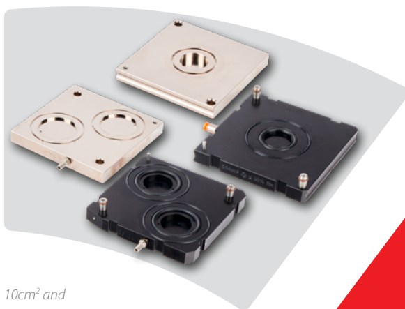
10cm 2 and 5.64cm 2 reduced test area cartridges