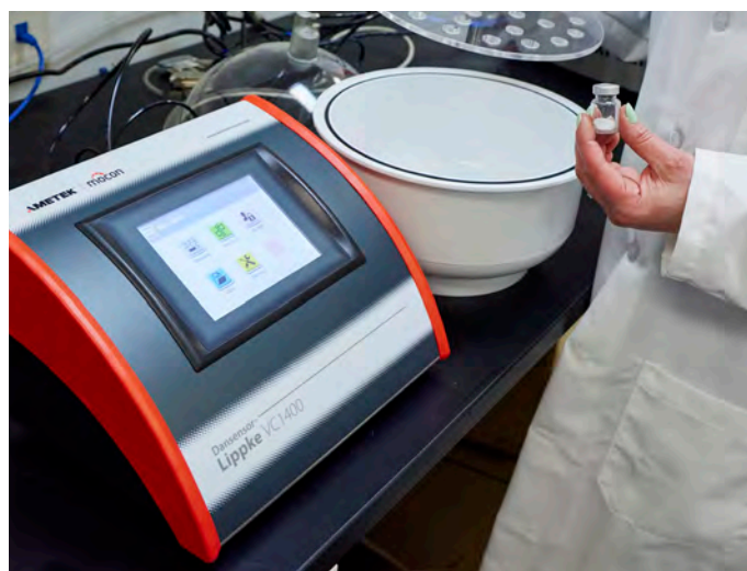
Dansensor Lippke™ VC1400