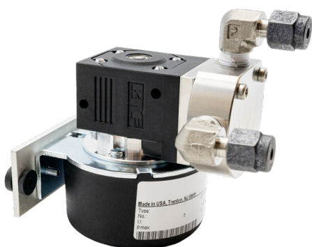
Sample Pump Assembly, 9000 Part No: 038-258

For use in the Baseline® 9000 Hydrocarbon Analyzer