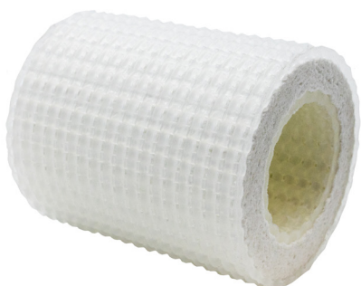
Replacement End-of-Line Filter Element Part No: 036-571

For use in the Baseline® 9000 Hydrocarbon Analyzer