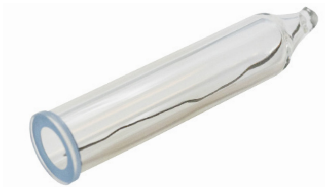
Replacement PID Lamp 10.6 Part No: 043-400