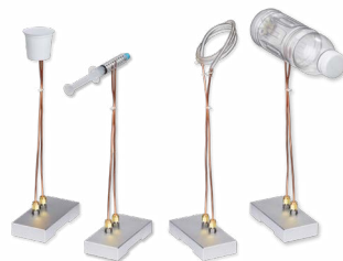
Whole packages, syringes, tubing, and more