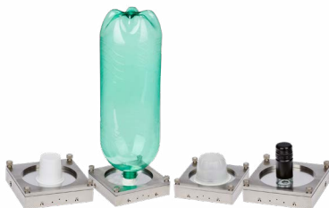
Bottles, cups, caps, and more

We offer a variety of cartridge options designed to fit a wide range of package types.*