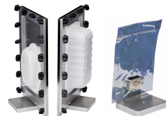
Large trays, cups, flexible pouches, bags and more

*Note: analyzer and cartridges are sold separately.