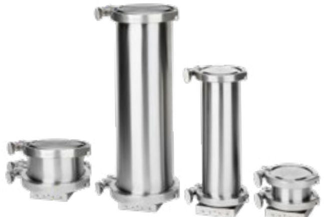
The Capture Vessel Cartridges are ideal for testing specialized medical packaging

AMETEK MOCON offers specialized test cartridges, such as the Capture Volume Cartridge, that simplify and speed up WVTR testing for medical packaging.