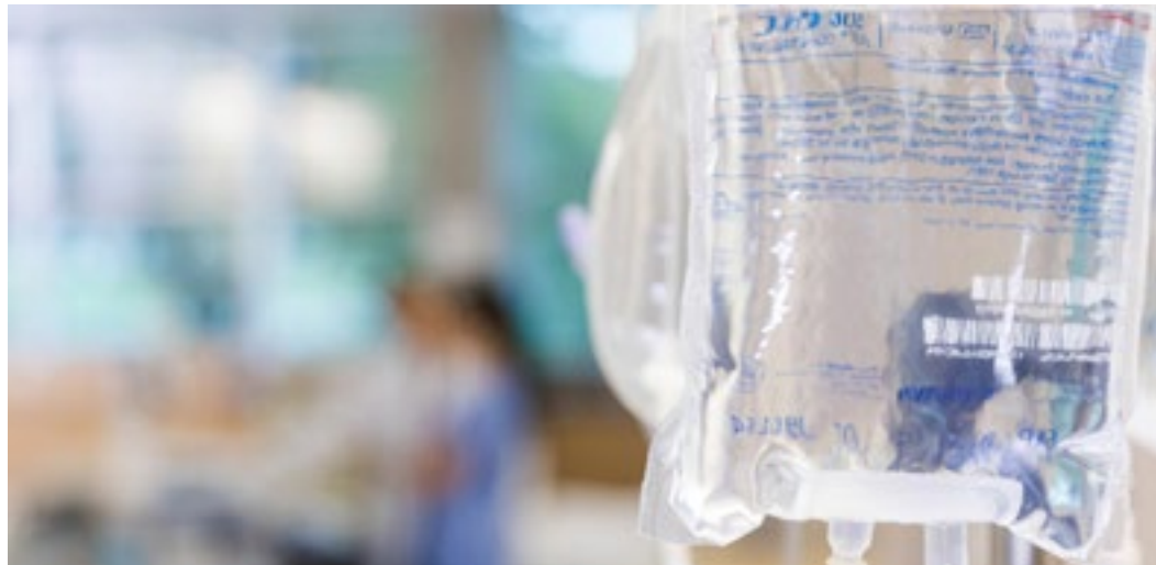
Certain drug delivery systems rely on a strong moisture barrier to maintain product integrity.

In the pharmaceutical industry, where compliance processes are complex and lengthy, it's crucial to obtain accurate R&D data as quickly as possible. However, evaluating drug delivery systems like glass vials and saline pouches can be difficult and time-consuming. AMETEK MOCON offers an ideal solution in the form of the Capture Vessel Cartridge.